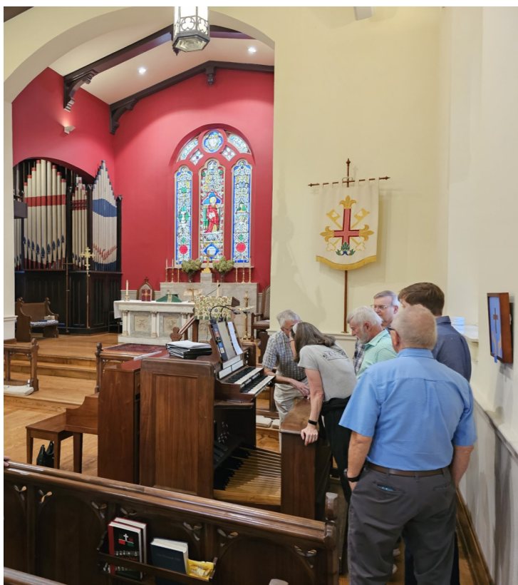
AGO members checking out the new console of the Holtkamp/Walker at St. Peters Episcopal, Paris