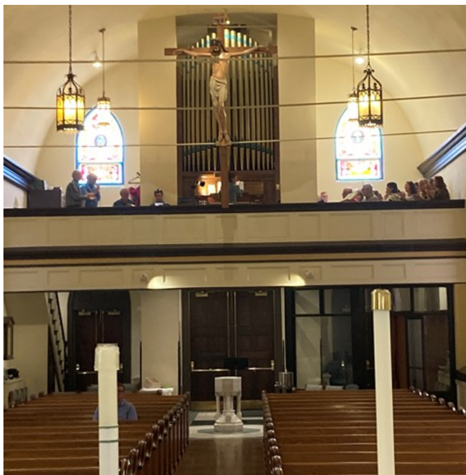
Members in the balcony of Church of the Annunciation, Paris