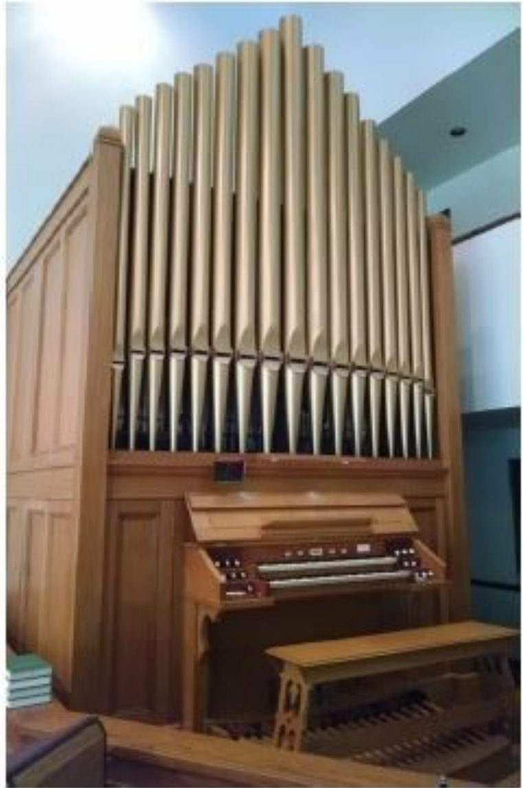
George Kilgen 1907, rebuilt by Roy Redman 1987