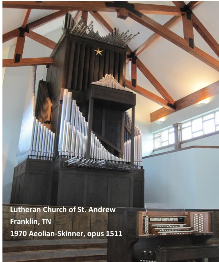
Lutheran Church of St. Andrew Franklin, TN 1970 Aeolian-Skinner, opus 1511

Organ Builders Restorations & Additions Serving the Southeast Since 1968