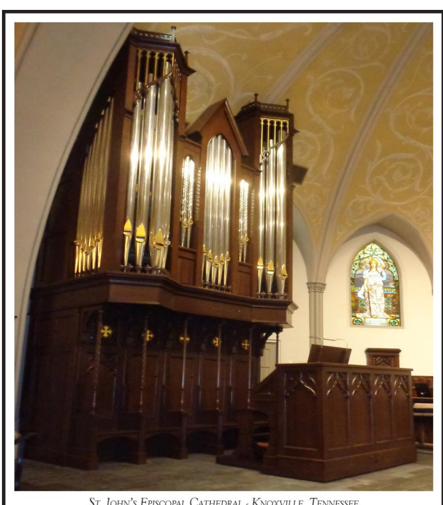
St. John's Episcopal Cathedral - Knoxville, Tennessee Opus 52 - Three Manuals - Seventy ranks