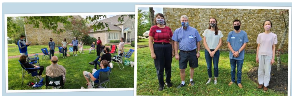
75th Anniversary Celebration Picnic and Installation of Officers 9-26-2020