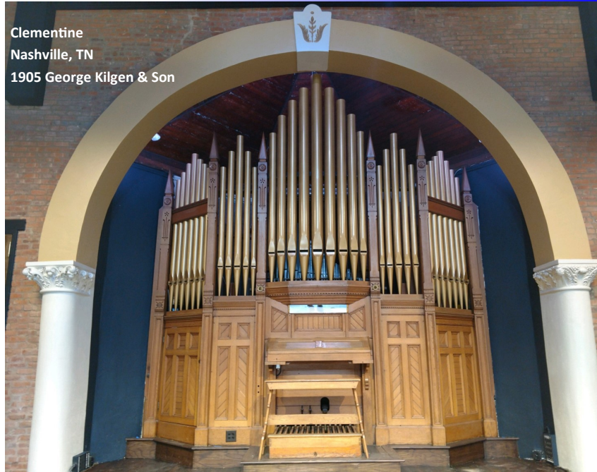
Clementine Nashville, TN 1905 George Kilgen & Son