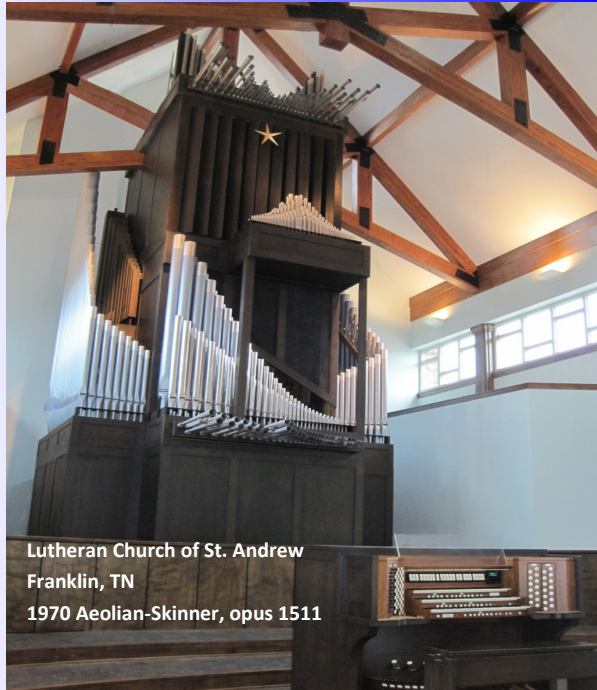
Lutheran Church of St. Andrew Franklin, TN 1970 Aeolian-Skinner, opus 1511

Organ Builders Restorations & Additions Serving the Southeast Since 1968