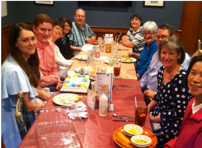
Chapter members at a luncheon at Ramsey's