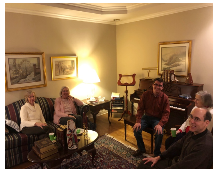
Friends gather in the living room after dinner