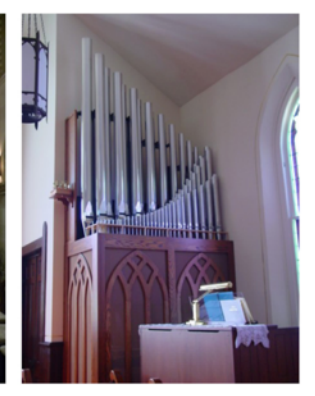
Visit us at: www.classicorgans.net