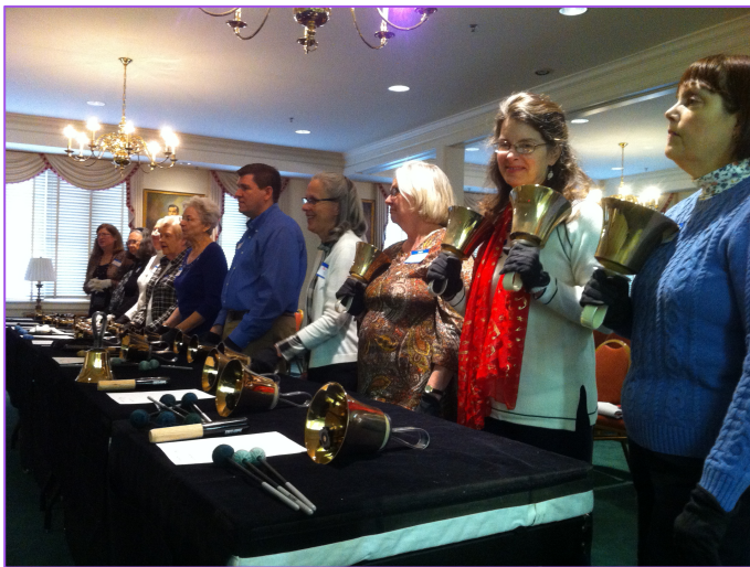
LexAGO members and guests at the handbell workshop at Christ Church Cathedral at the 2018 January Jubilee