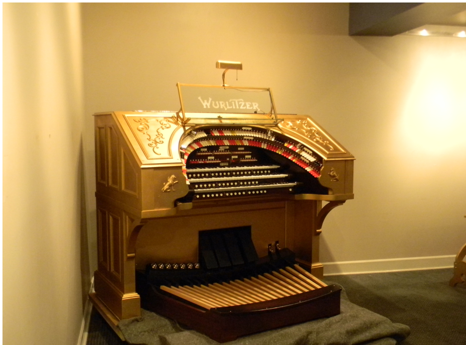
The completed Wurlitzer III/18 console