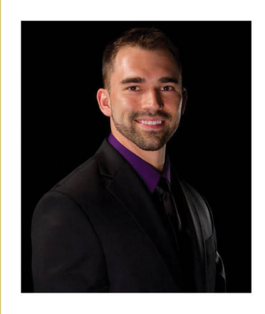
Concert & Evensong