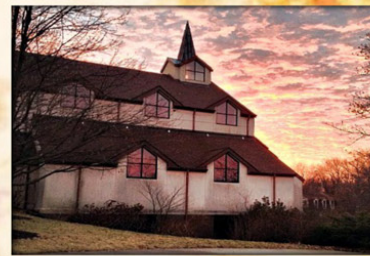
St. John's, Versailles