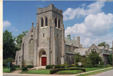
St. Michael the Archangel