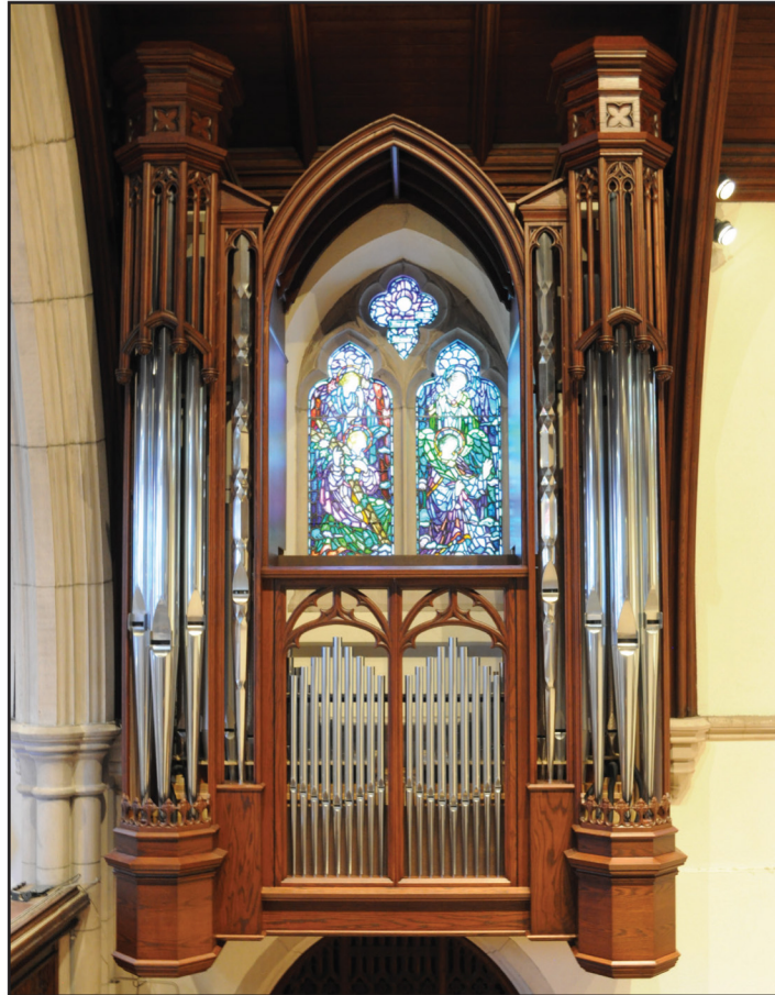
Opus 50 • Good Shepherd Episcopal • Lexington, KY • IV/58

Artistry... Hand-crafted cases, chests, and consoles built in our shop from the best materials by expert craftsmen and designers