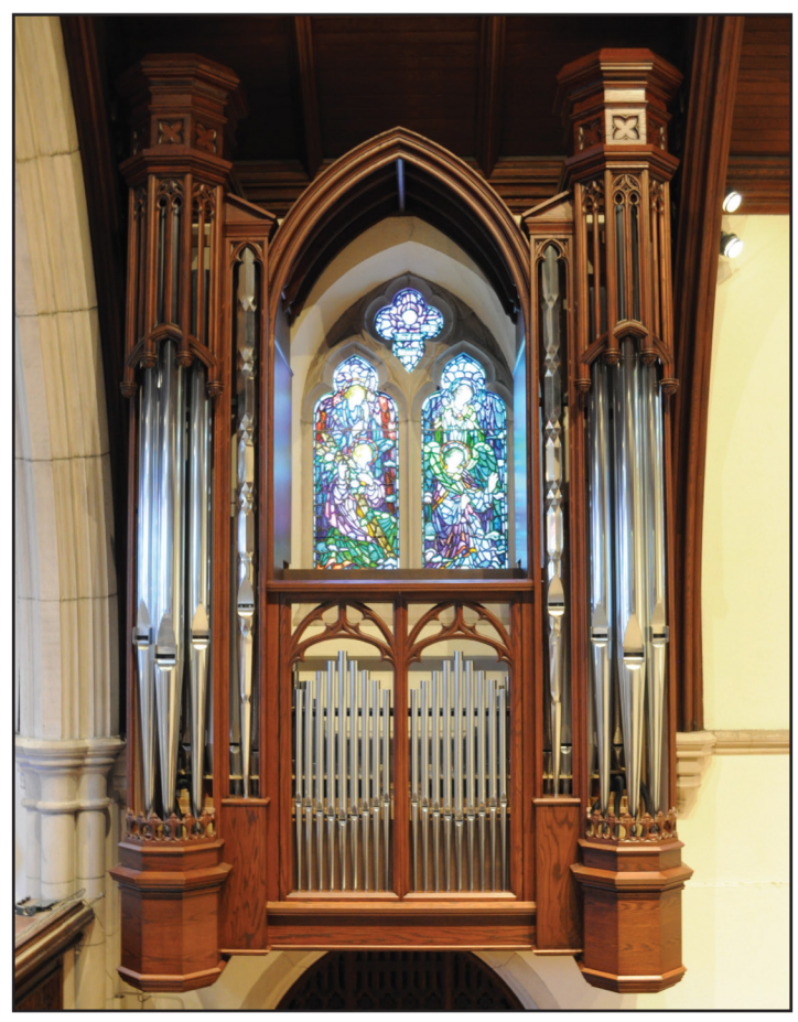
Opus 50 • Good Shepherd Episcopal • Lexington, KY • IV/58

Artistry... Hand-crafted cases, chests, and consoles built in our shop from the best materials by expert craftsmen and designers